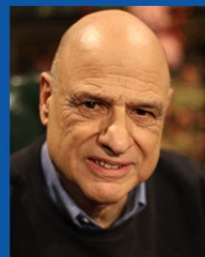
Tony Campolo Eastern University

TUESDAY, SEPTEMBER 26, 2017 | 7 P.M. NEW ORLEANS BAPTIST THEOLOGICAL SEMINARY